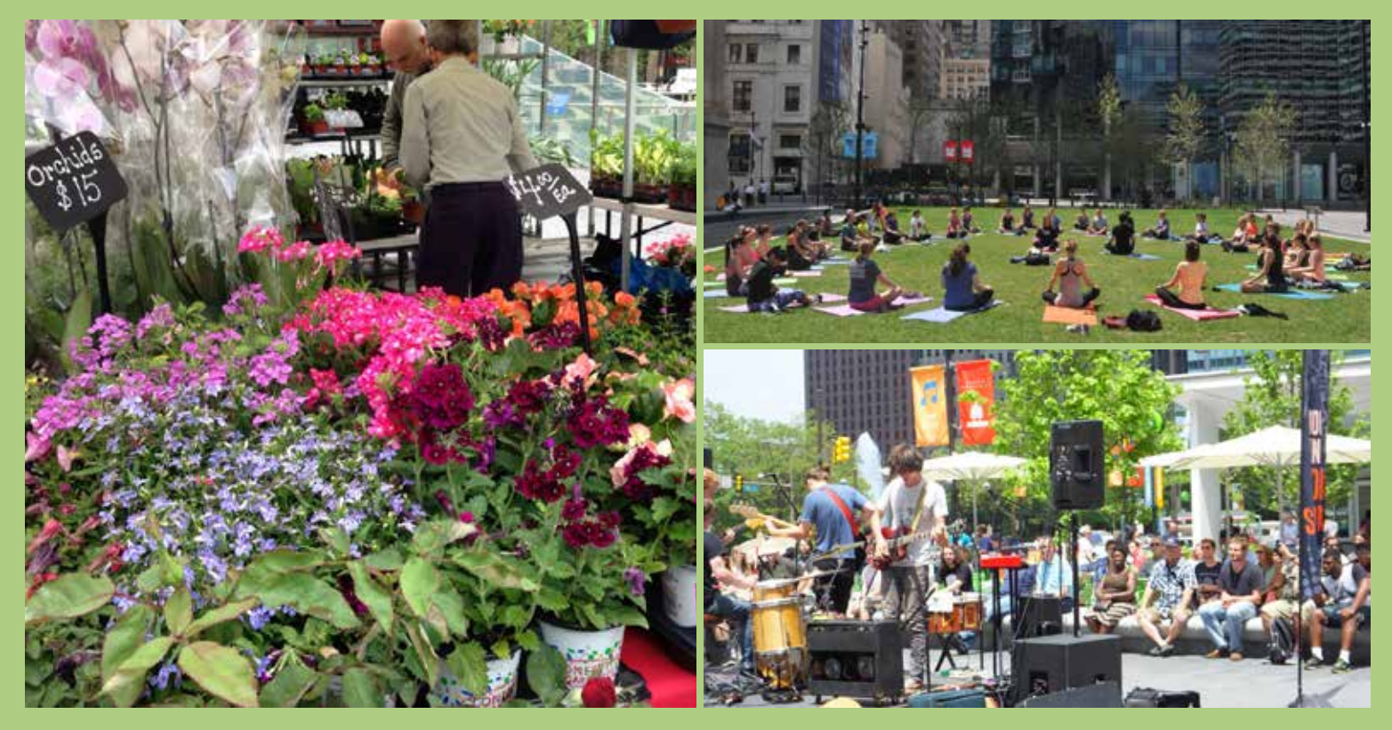
In addition to its many amenities, Dilworth Park is busy with a variety of activities – something for everyone – throughout the summer and the entire year

Summer is the perfect season to stop by Dilworth Park, where you can enjoy a cooling stroll through the fountain, live music, evening drinks and tasty foods from Rosa Blanca Café, with al fresco dining on the PNC Terrace. Rosa Blanca Café is open Monday through Friday, 8:00 a.m. to 9:00 p.m.; and Saturday and Sunday, 11:00 a.m. to 7:00 p.m.