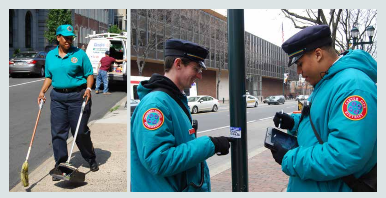
CCD staff clean sidewalks, remove graffiti, provide public safety patrols and note on hand-held pads deficiencies and problems that are reported to multiple agencies.

The response? Every other month, teams of our CSRs survey the entire District with hand-held tablets and report on those 83 different public space conditions (see stories on pages 3 and 10). Everything is geo-coded and tied back to a database that lists the agency responsible for maintenance. Quick emails and periodic meetings help with follow-up. Beginning as eyes and ears for the police, CSRs have evolved into public space managers who assist and coordinate with almost two dozen other public agencies. The goal is not to find fault, but rather to fix problems.