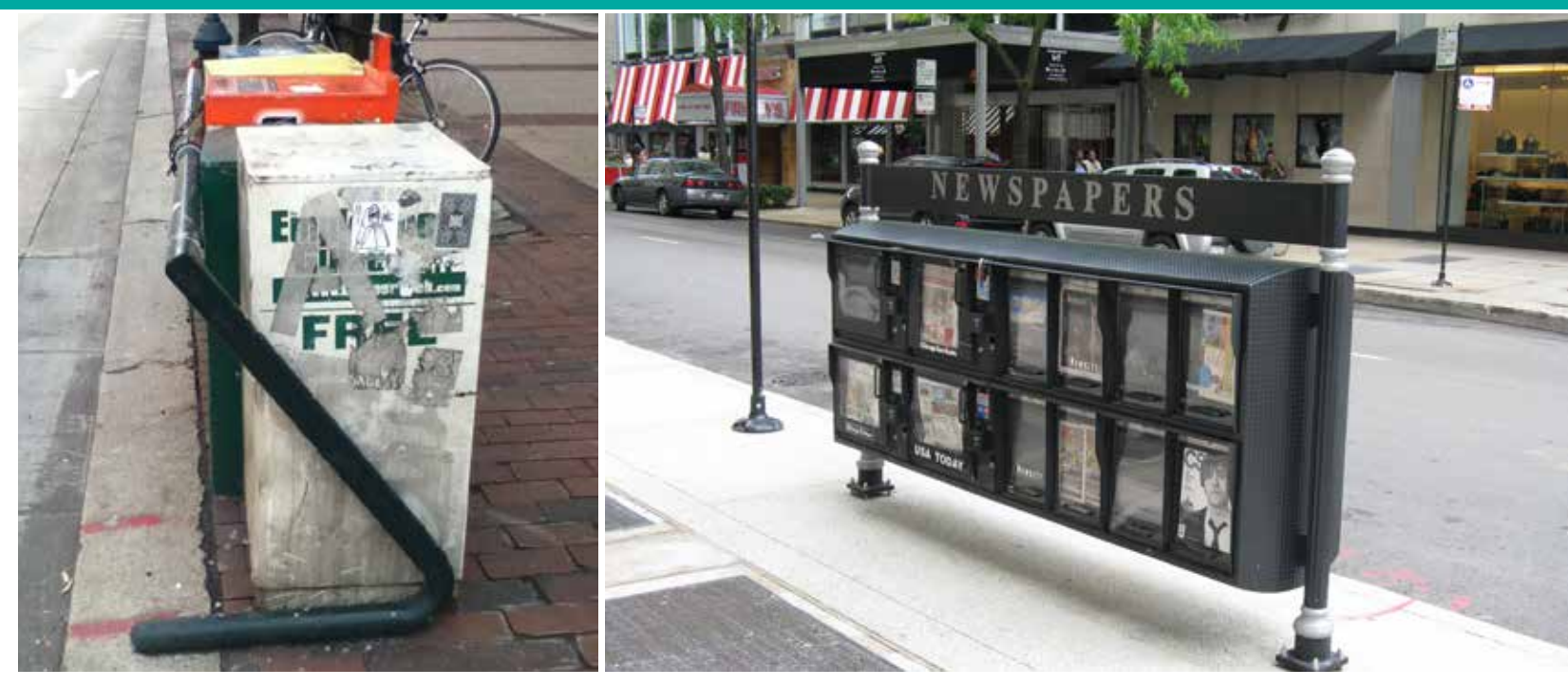
Chicago has consolidated newspaper boxes into "condo" units that are easy to clean and far better organized.