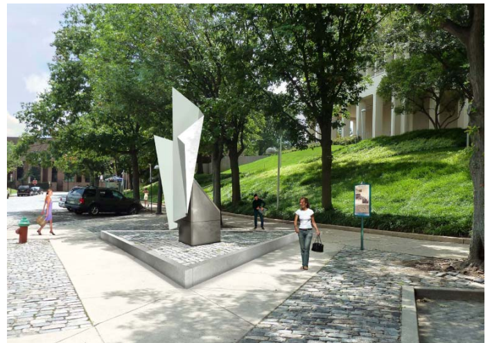
Phoenix Rising in new location on Dock Street Rendering: KieranTimberlake

To learn more about the project and how you or your company can become a financial supporter of the transformation of Dilworth Plaza, please visit http://www.centercityphila.org/life/dilworth_plaza.php .