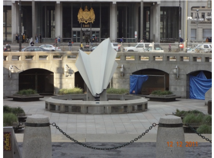
Phoenix Rising at Dilworth Plaza